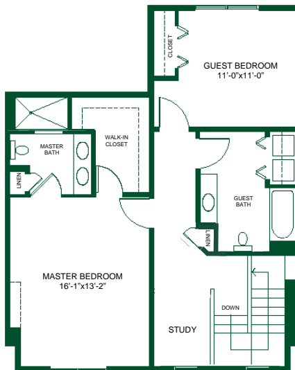
Upper Level • 818 square feet